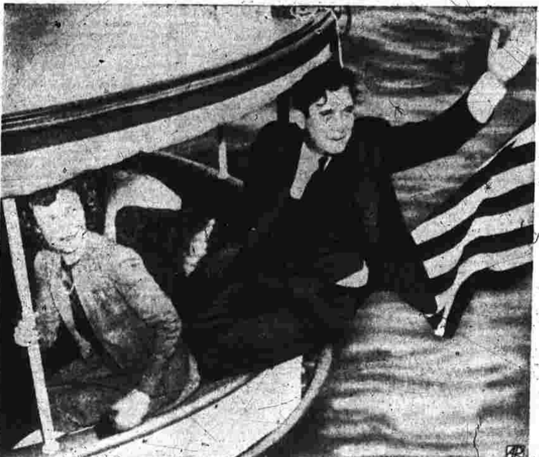
Wendell L. Willkie, the utilities executive who is the G. O. P. choice for the presidency, and his wife are shown as they left Philadelphia aboard the yacht of Publisher Roy Howard for a week-end cruise. The Republican nominee told newsmen he and his advisers came to no conclusion at a lengthy meeting the previous night on whether to retain John D. M. Hamilton as chairman of the National Committee.